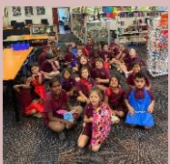
Sharing a love of reading