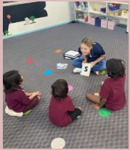
Daily phonic lessons learning new sounds

We Love reading at Townview state school and want every child to be successful readers. Take a look at what reading looks like in for our students that are learning to read.