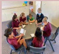
Reading practice using decodable readers